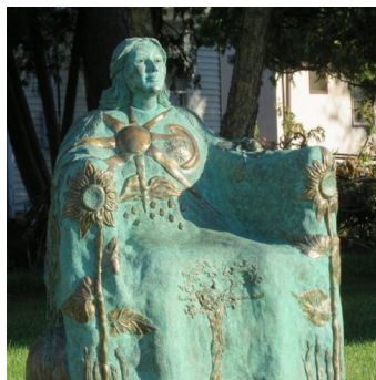
"Bountiful Bench" sculpture

We are excited about the return of Dance Avondale , who will perform a new set of dances at Mayfair Park on Saturday, June 11 , beginning at 6pm (see the notice elsewhere in this newsletter). Last year's performance was fantastic and covered classical, modern, and other formats—something for everyone! Bring a picnic basket and enjoy the show.