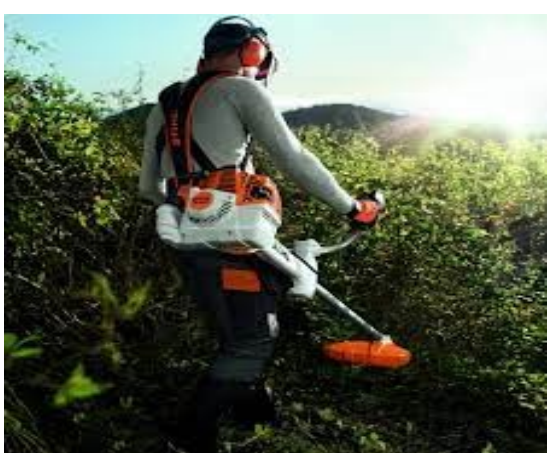
From cutting buckthorn by hand with loppers ... to using the Stihl FS Brush Cutter

DONATE BY CREDIT CARD at <a href="https://bit.ly/3G2CF9z">https://bit.ly/3G2CF9z</a> or scan the QR Code with your smart phone: