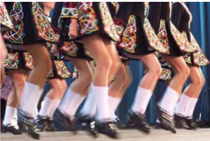
The talented Trinity Irish Dancers make their intricate steps look effortless

The party starts at noon and continues until 10:00 p.m. Tickets are $10 for adults; children 12 and under are free. (You also may want to join us for mass at 11:00 a.m.) Tickets can be purchased by calling (773) 282-7035, ext. 10 or visiting the IAHC office.