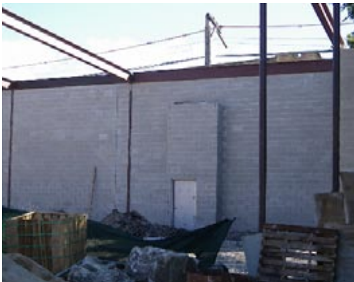
The back wall of the new construction butts up to the alley, requiring the wall to be constructed with an indent to accommodate an existing telephone pole.